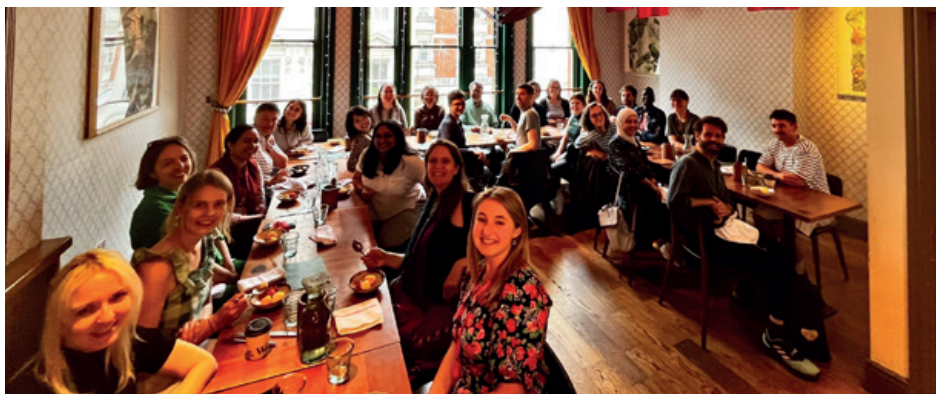
The GHSM end-of-year celebration for staff